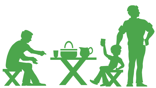
Guide 4-H project work. Doing it for them does not develop life skills.

Participate in Parent-Volunteer Training to enhance personal knowledge of 4-H.